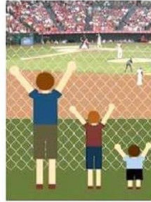
removal of systemic barriers